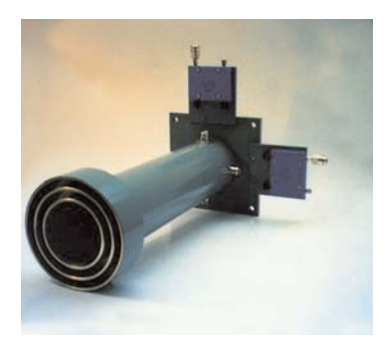
Choked probe view, showing the hyprrid feed network