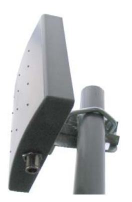
Front View of antenna