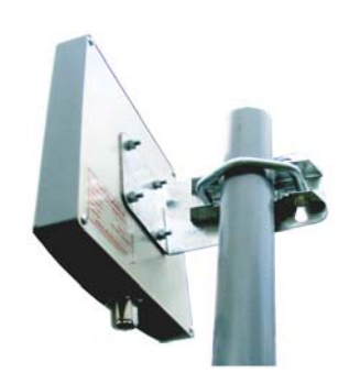
Pole mount tilting barcket fitted to antenna